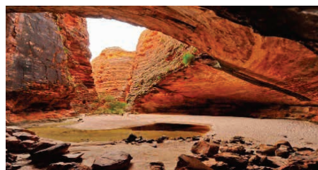
Bungle Bungle Ranges - East Kimberley