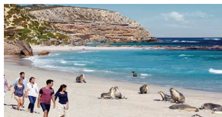
Kangaroo Island Wildlife