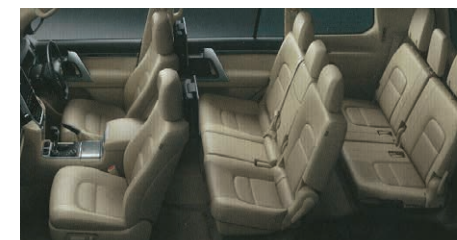
A 6 seater Luxury 4WD