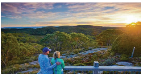
Warburton High Country