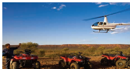
Helicopter or Quad bike to Glamping site