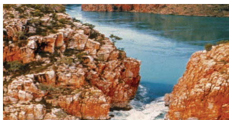
Horizontal Waterfall - A Kimberley Icon