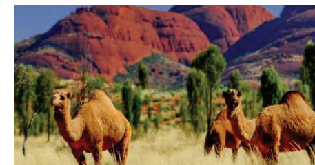
Kings Creek Station Camels