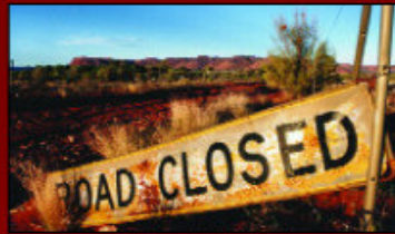
Not all roads lead to Alice!