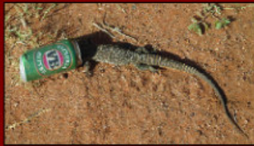
Flat out like a lizard drinking!