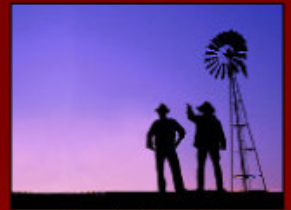
Star gazing in the outback